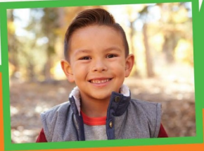
Helps Me Do Right!