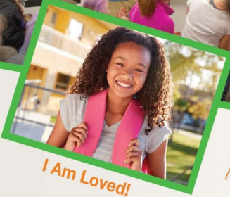
I Am Loved!